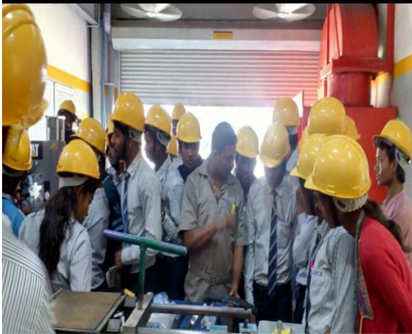
Students observing learning the flow process