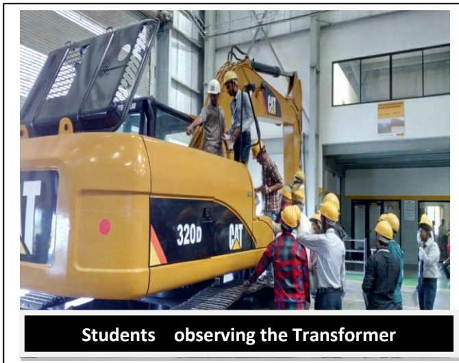
Students observing the Transformer