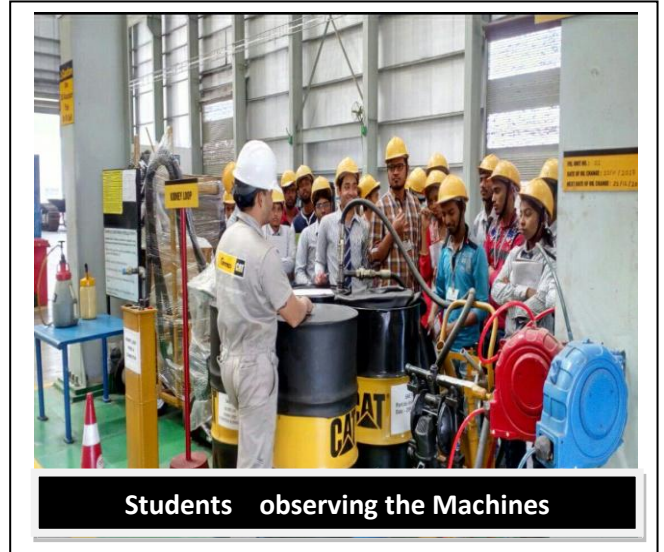
Students observing the Machines