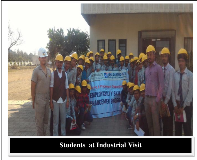
Students at Industrial Visit