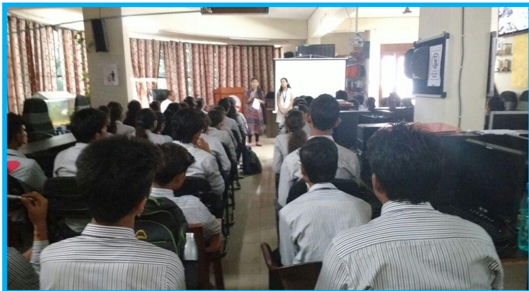
Students interacting with Experts