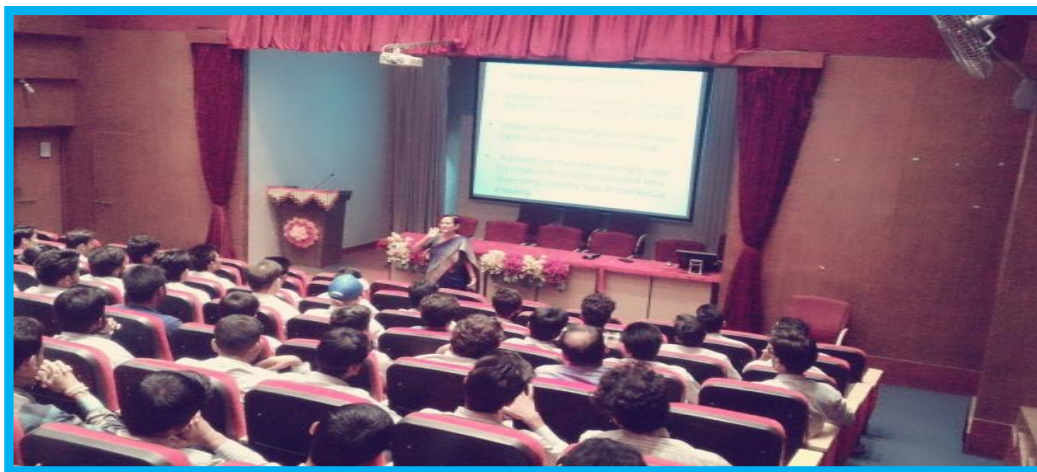
Expert explaining about IPR’s

Experts from the Rajiv Gandhi National Institute of Intellectual Property Management were fascinated by students for their knowledge and enthusiasm towards the Intellectual Property Rights (IPR’s). The students showed great interest and enthusiasm in understanding the information about Intellectual Property Rights (IPR’s). Around 100 students from fifth semester have attended this program.