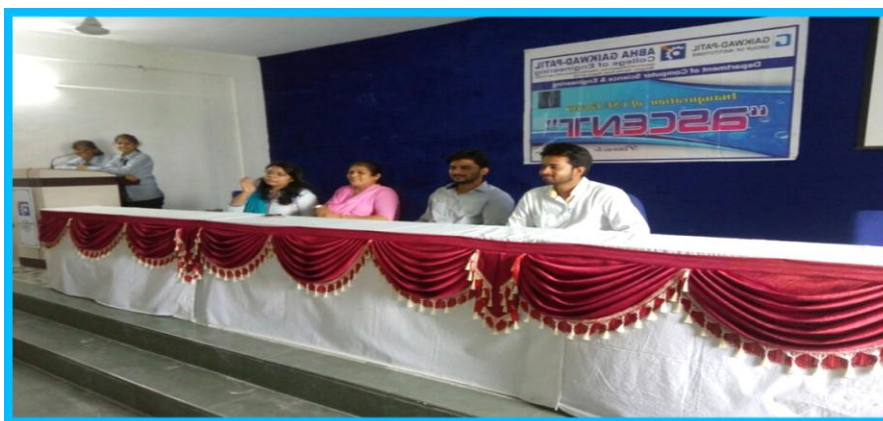
Faculty during Forum Installation