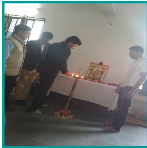
Lightening of Lamp by HOD