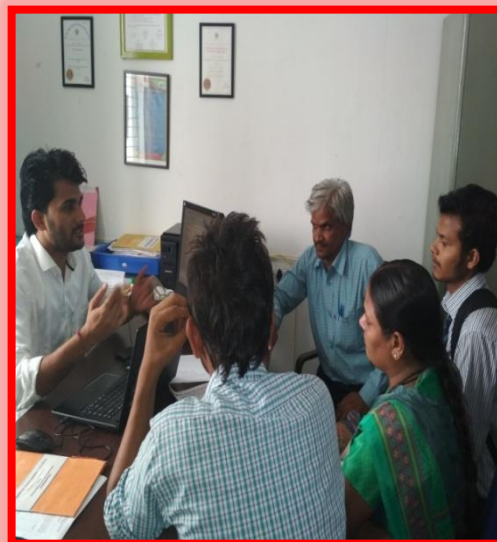
Parents sharing their views with teacher