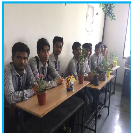
Students with their saplings