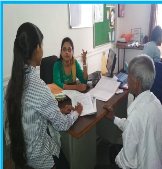
Faculty interacting with student