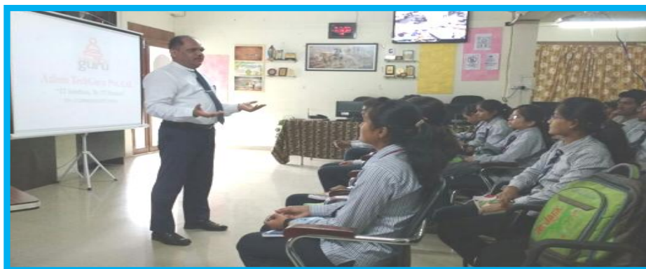
Expert delivering lecture to Students