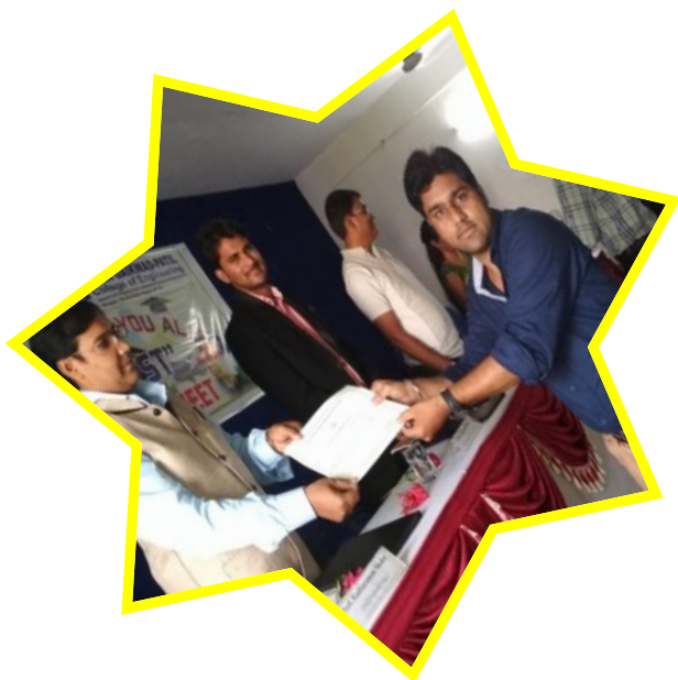
Alumni receiving degree