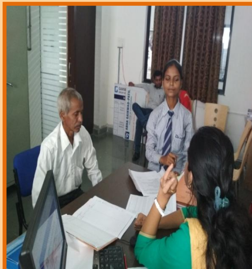
Faculty counseling with parent and student