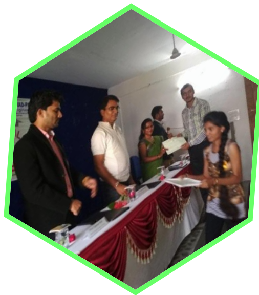
Alumni receiving degree by the hands of HOD