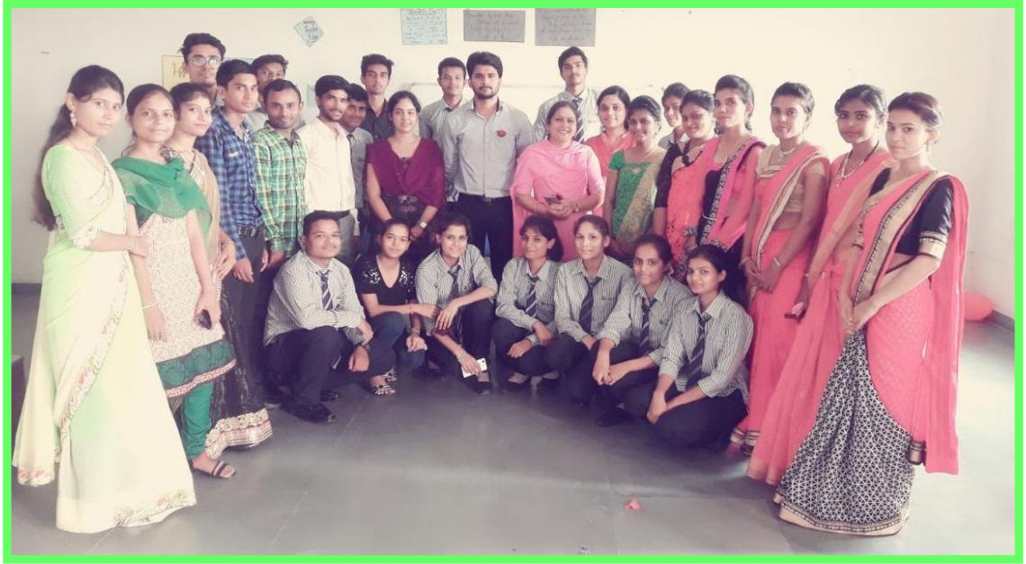
Teacher's day celebration in the department

Dear Teacher, Thank You For Continually Inspires me to do my best You help me strive for goals, I found guidance, friendship, discipline and love, everything, in one person. And that person is you