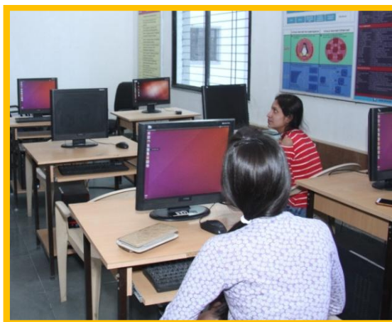
Students listening to teacher