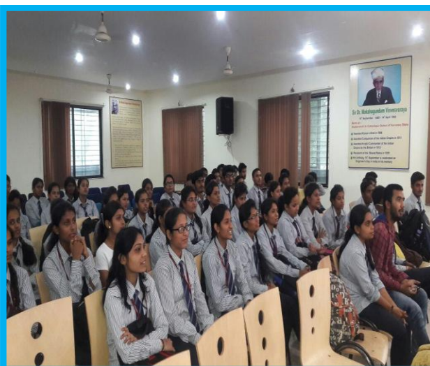
Students attending the Guest Lecture