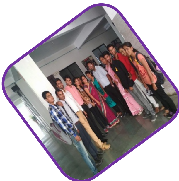
Students and Teachers during Alumni Meet