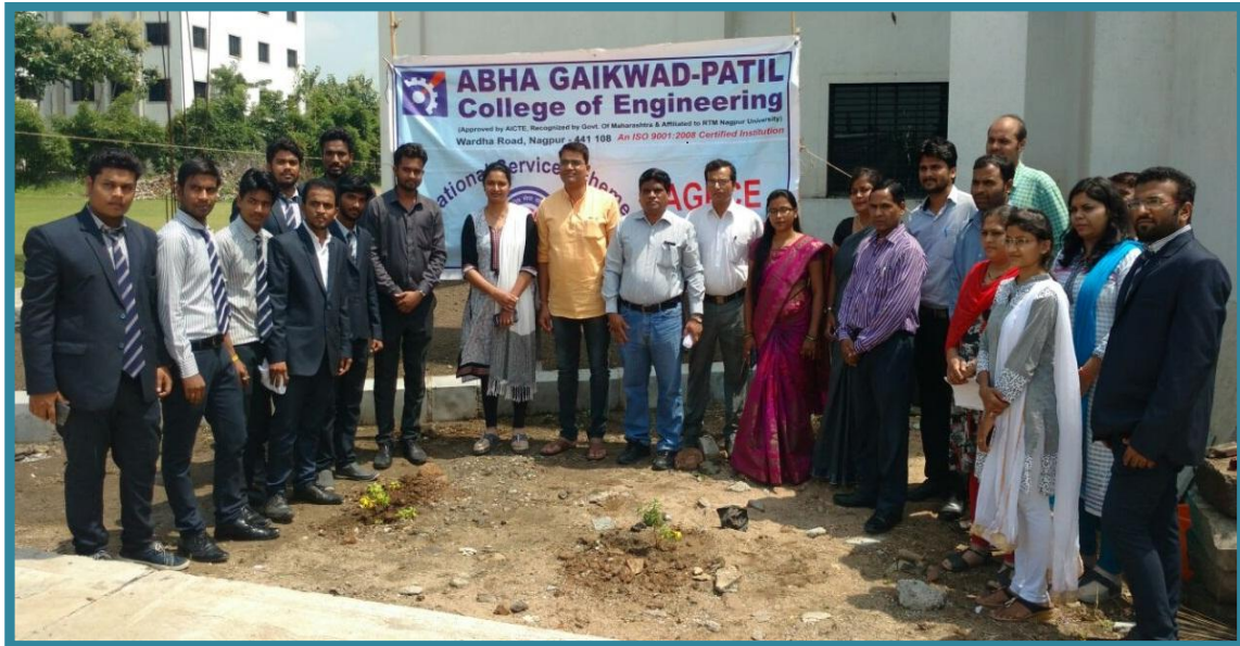
Guests and Students during the event