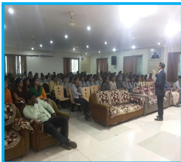
Guest interacting with students

The main objective of this seminar is to aware students about the recent technologies used in the industries and how to learn the latest technologies. The Management and Principal AGPCE appreciated the efforts taken by the Head of Department and staff members for the successful conduction of the seminar.