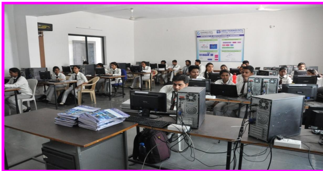
Students performing practical in the lab 1