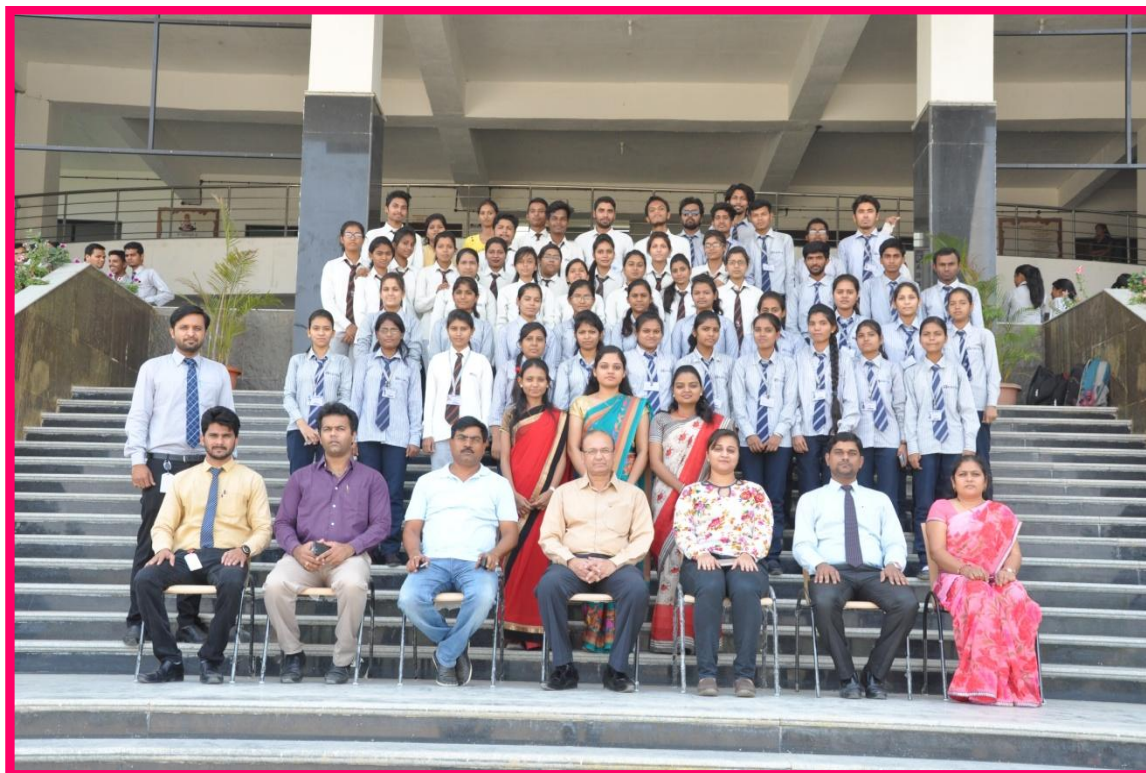
Faculty and Students of the Department