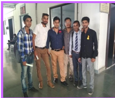
Students during the alumni meet