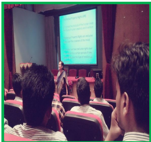
Students listening to Expert