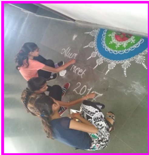
Students drawing rangoli