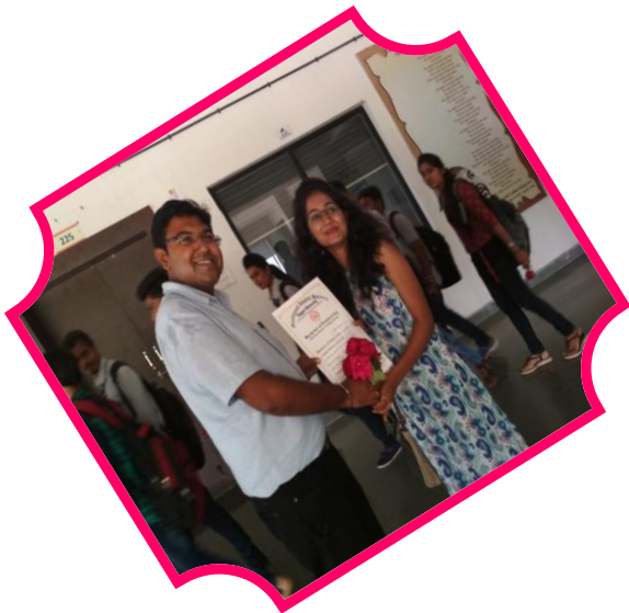
Alumni receiving degree