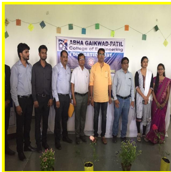
Guest during the Inauguration of the event