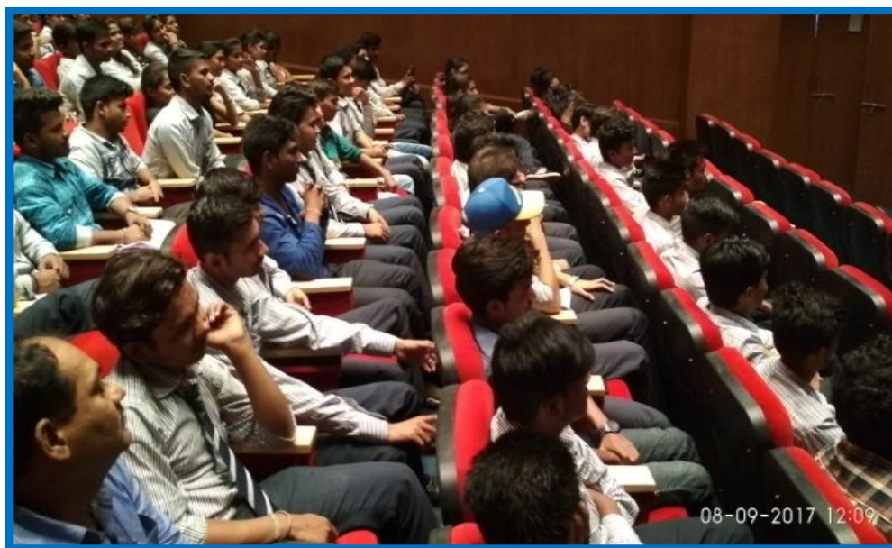
Students present during the session