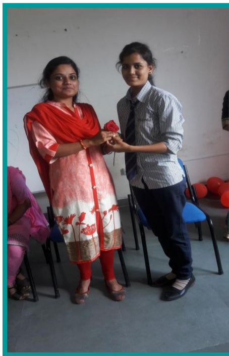
Students welcoming the Teachers