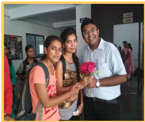
Faculty with students