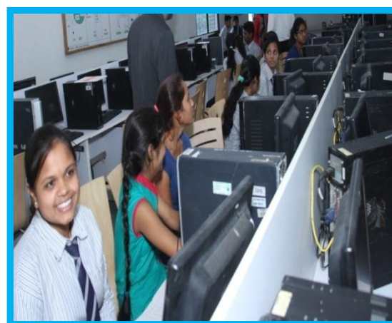
Students performing practical in the lab 2