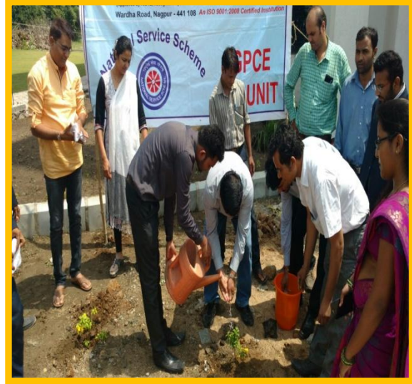
Guests planting the trees