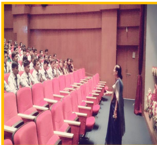
Expert interacting with students