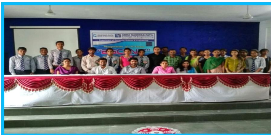
Student and Faculty during Forum

Management, Principal, Vice Principal AGPCE graced the occasion. Head of the Department congratulated students for forum installation and motivated them to implement innovative ideas under the student forum.